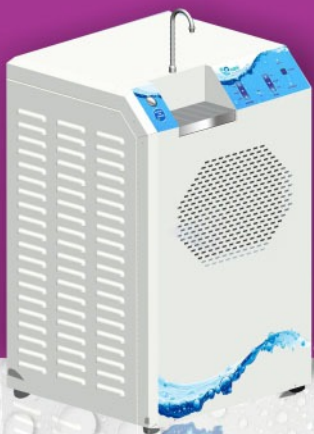
TABLE TOP UNIT